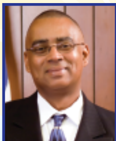
North Chicago Mayor Leon Rockingham